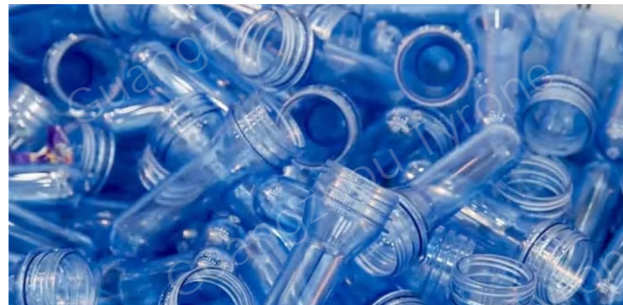
Blow molding parts