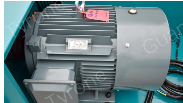
Copper core motor

The cutting blades is made of high-strength alloy blades steel, which has high hardness and strong wear resistance. The blade grinding can be reused.