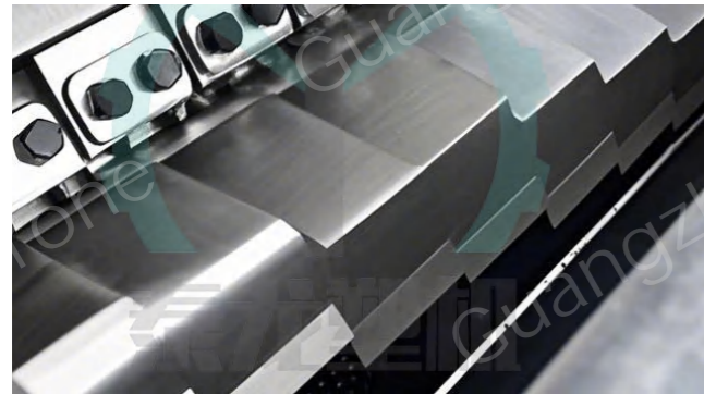
Alloy steel blade

The cutting blades is made of high-strength alloy blades steel, which has high hardness and strong wear resistance. The blade grinding can be reused.