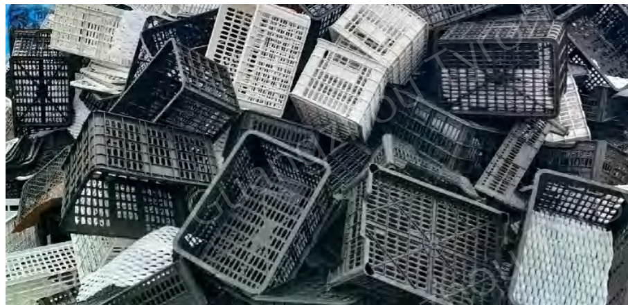
Plastic screen frame